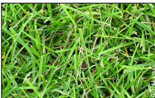
A healthy, dense lawn can help protect water quality when managed correctly.