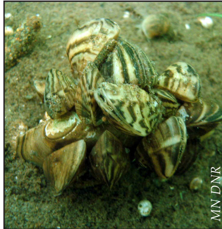
Several zebra mussels have attached to a native mussel, which can lead to its demise.

Much research has been done searching for a way to control zebra mussels in natural waters. While industry uses a variety of chemicals, most of these are not registered for use in natural waters, due to their toxicity to other aquatic animals. A few attempts by resource agencies (including the MN DNR) have used copper products to attempt limited control. However, copper products can cause fish kills, so this chemical is not viable for larger areas of lakes. Potassium chloride was used under a special permit in one small quarry in the state of Virginia, but this product is not permitted for general use in lakes or rivers. Recent attention has been focused on a bacterial control product. Scientists discovered a strain of common soil bacteria ( Pseudomonas fluorescens ) that kills zebra