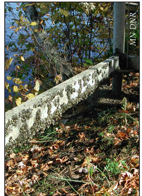
Hundreds of zebra mussels have attached to this boat lift before it was removed from the lake.

While there are some intriguing aspects of Zequanox®, there are also significant questions that remain. The high dosages and long exposure times used by industry create major difficulties for possible open water use. Zebra mussels need to eat Zequanox® for it to be effective, and keeping this material in the water long enough for it to be toxic presents a major hurdle. Finally, even in industrial settings, complete kill of zebra mussels is not often achieved. Studies may provide answers to some of these questions, but it also may be that this control might only be useful over small areas of water. Right now there is no effective, environmentally safe control material for lake-wide use. The best alternative for control remains prevention of spread. Draining water from boats, cleaning off boats and other gear and making sure that any docks, lifts or other equipment purchased second hand are completely and thoroughly cleaned can prevent mussels from hitching a ride to our lakes. ■